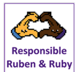
Responsible Ruben & Ruby